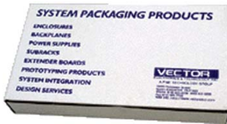
VectorPak™ Kit (CCK)

CG1-series VectorPak™ card guides sold separately