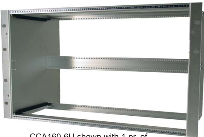
CCA160-6U shown with 1 pr. of CG1-160 card guides installed